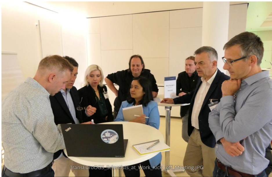
Scientists at work – consortium partners representing Germany, Greece, Ireland and Luxembourg discuss the technical work of the TransEuroOGS project