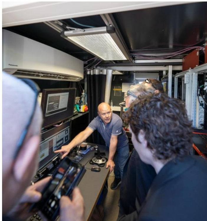
On day two of the consortium meeting, partners had the opportunity to view the ongoing work in quantum communication technology at Fraunhofer IOF in Jena.