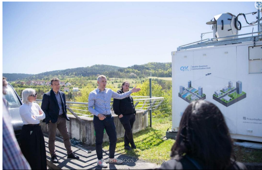
Scientists at work: The consortium enjoyed a tour of a mobile quantum unit at Fraunhofer IOF in Jena.