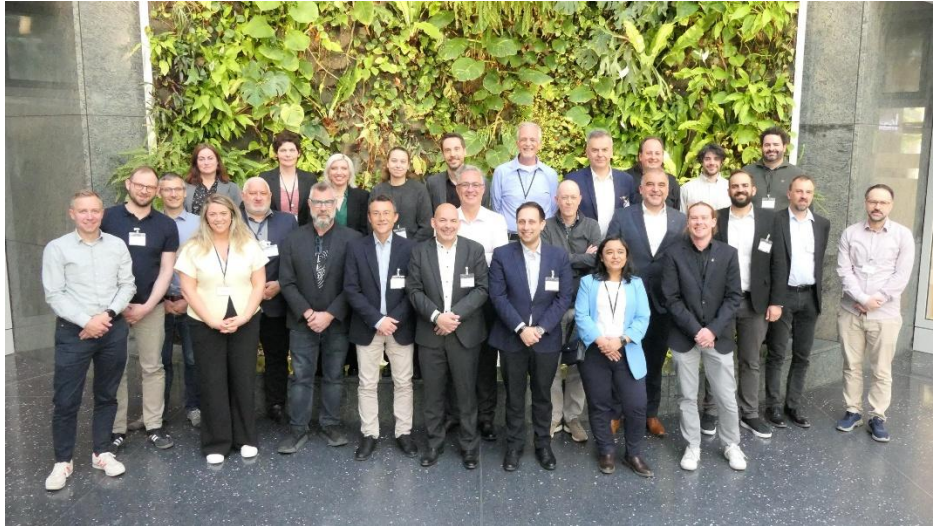
TransEuroOGS consortium partners pictured at the project kick-off meeting in Berlin.