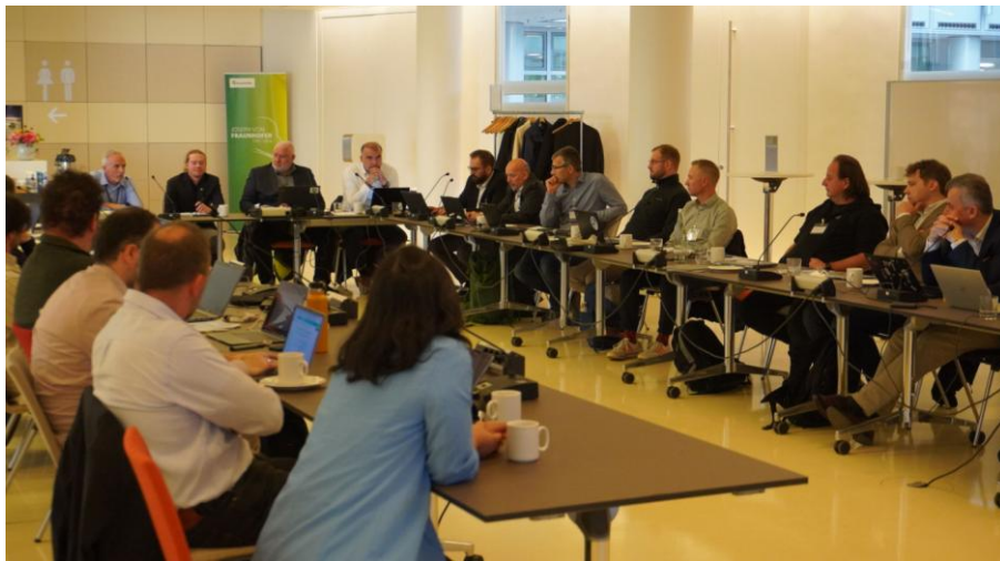
Scientists at work – consortium partners representing Germany, Greece, Ireland and Luxembourg discuss the technical work of the TransEuroOGS project.